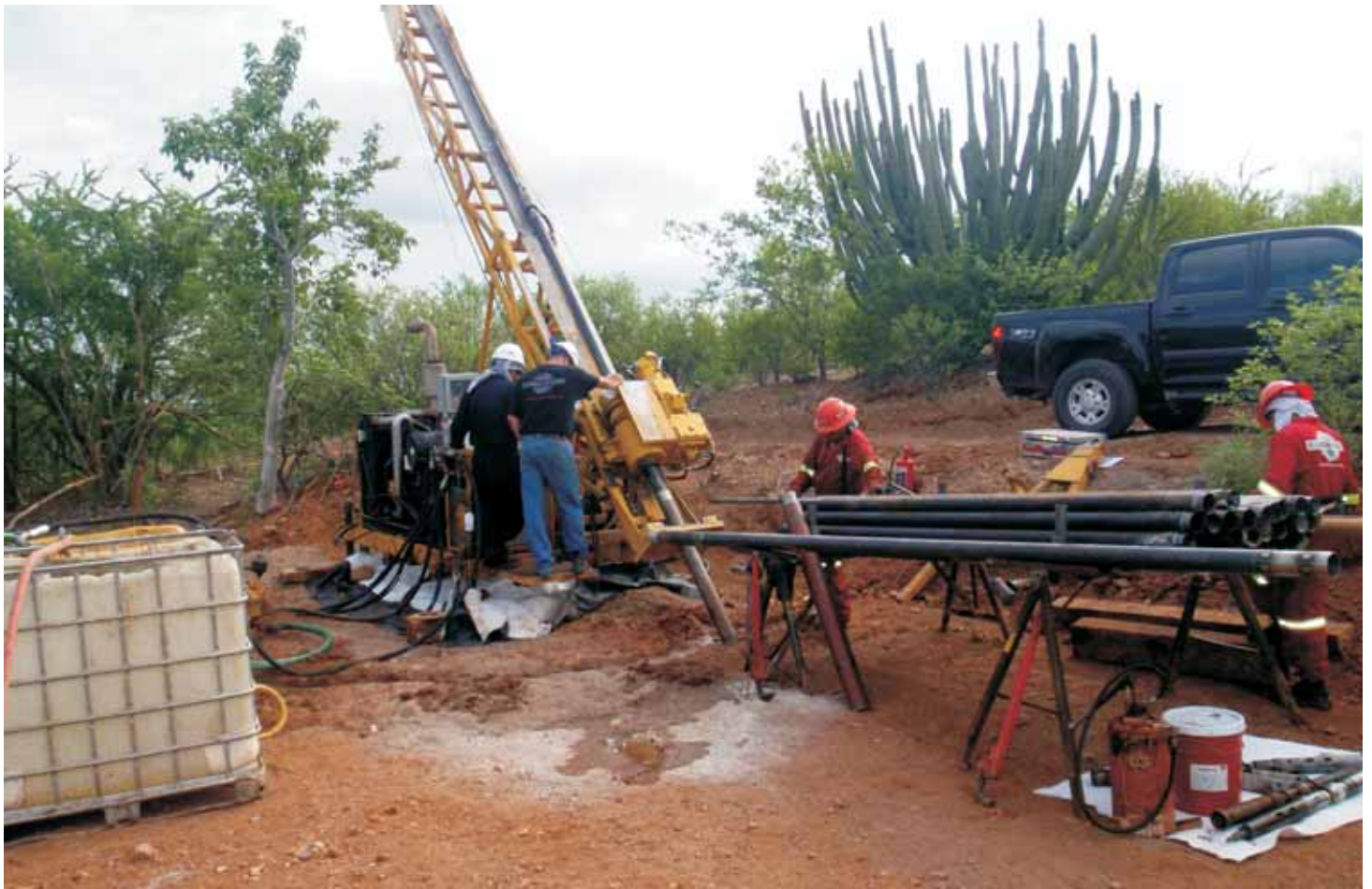
Diamond drilling at Golden Gate.