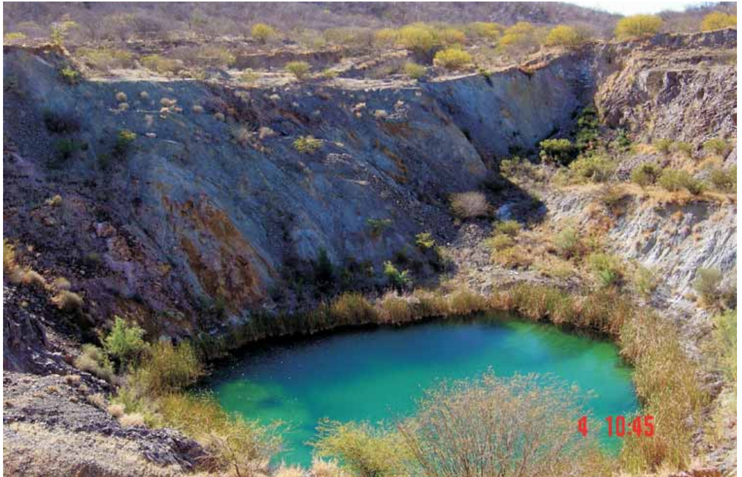
Formerly operating San Martin open pit mine.