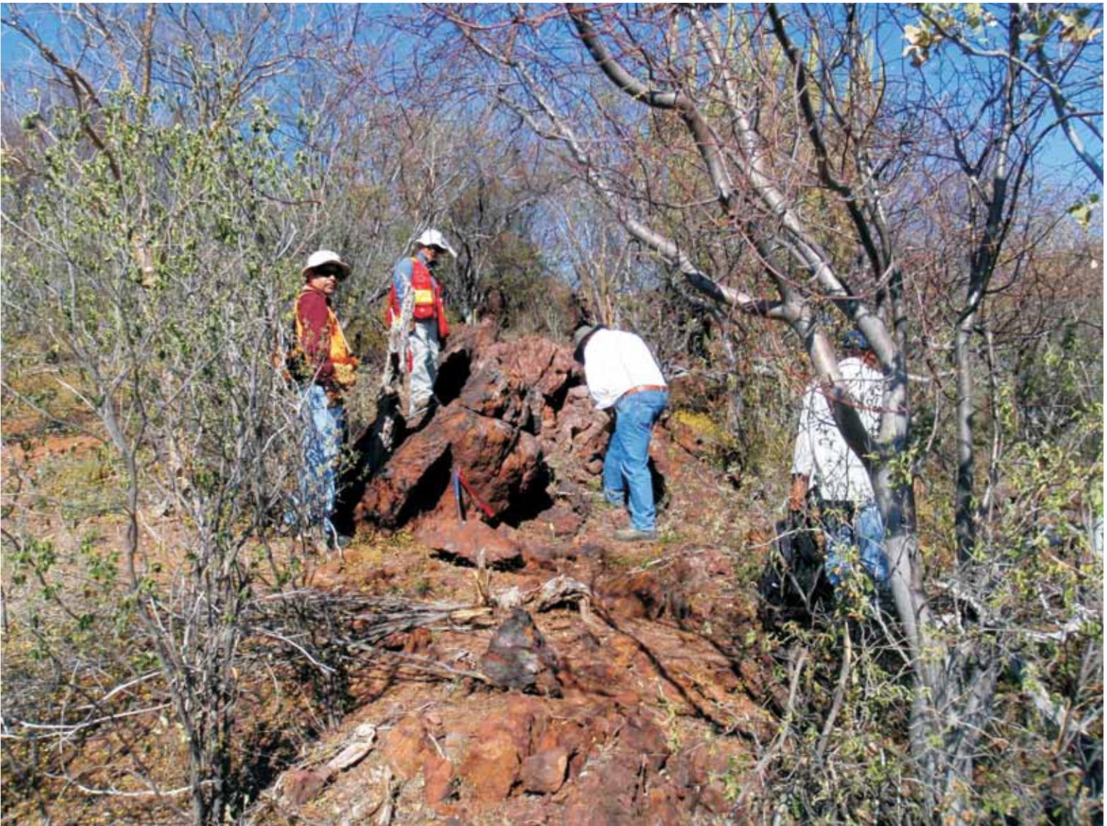
Mineralized structure in the north zone.