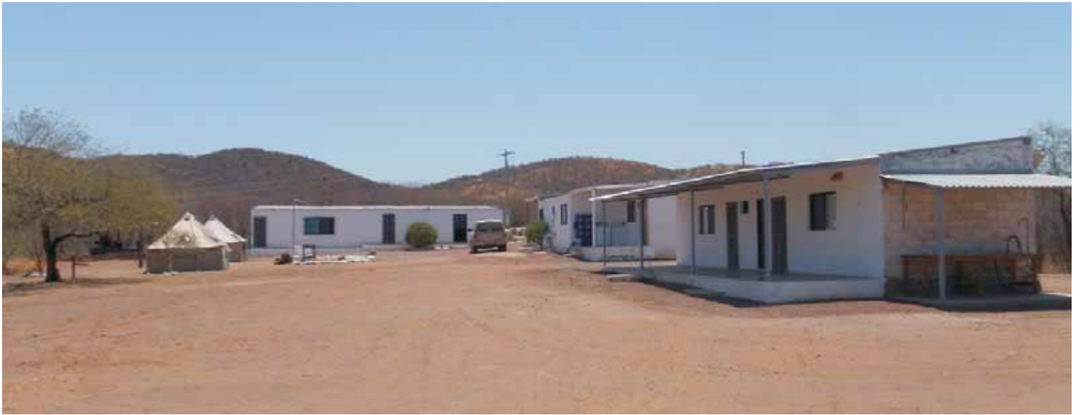
Agua Grande exploration camp located at the Batamote mine site.