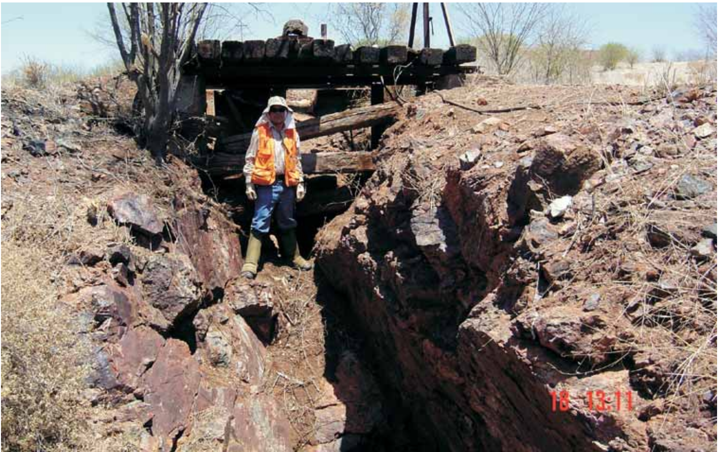
Shaft entrance at Batamote mine.