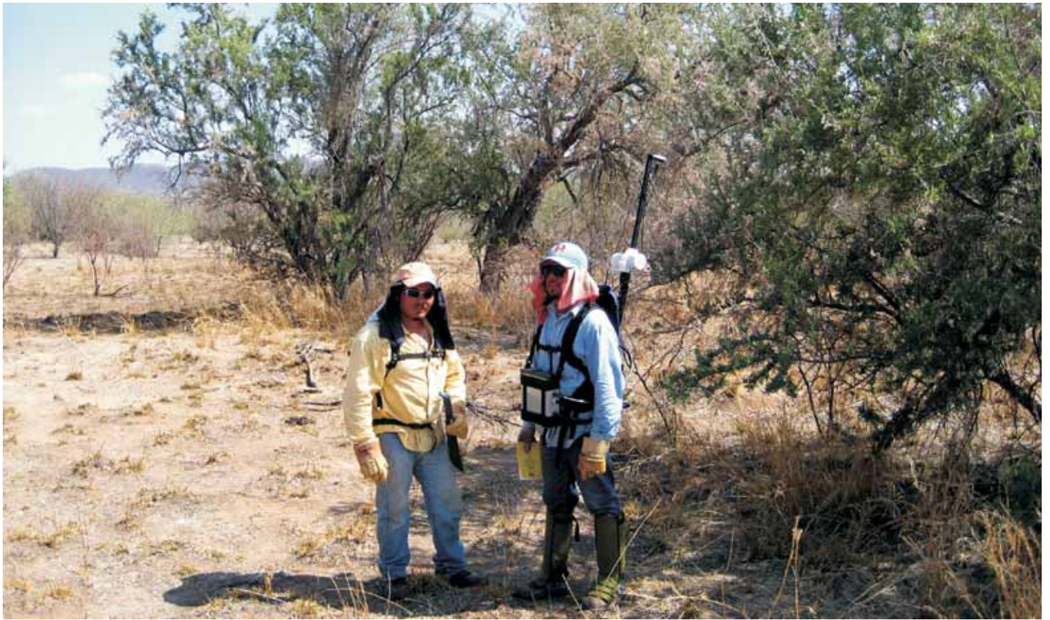
Ground magnetic survey in the south zone.